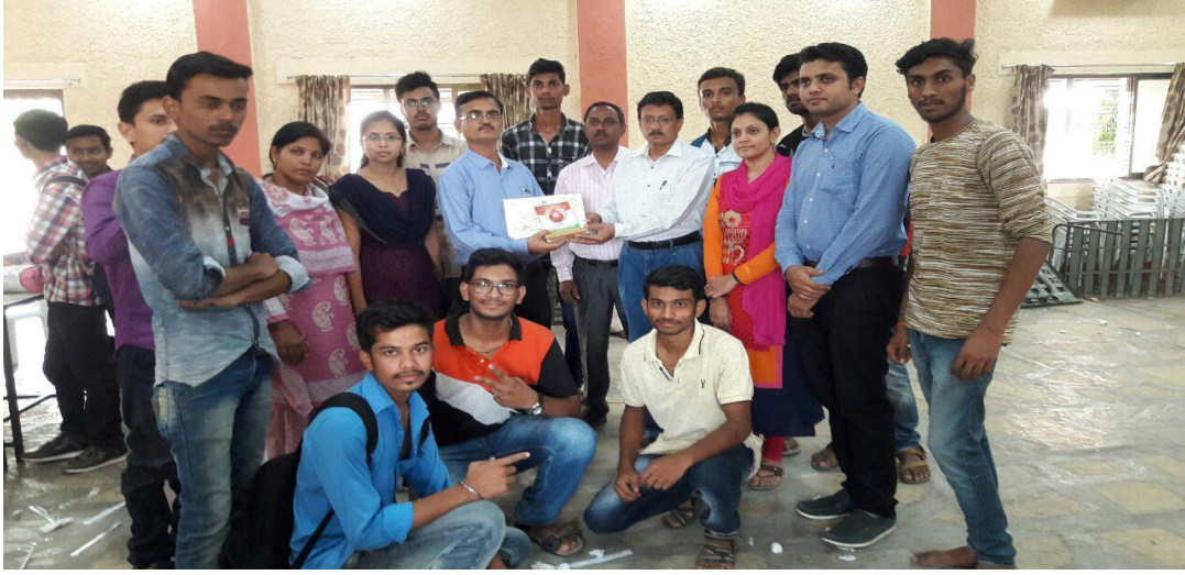
दि. 06/10/2017 रोजी रक्तदान शिबिराचे आयोजन