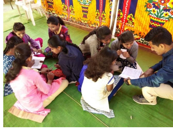
दत्तक ग्राम सर्वेक्षण अहवाल