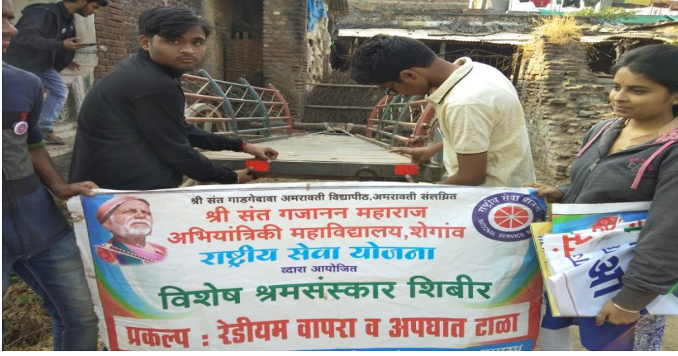
रस्ता सुरक्षा अभियान