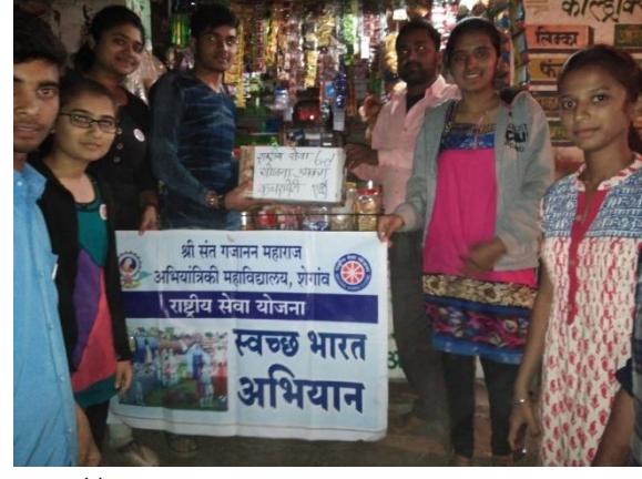
स्वच्छता अभियान संदेश व चळवळ