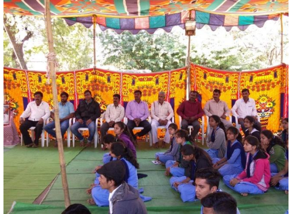
महात्मा गांधी जयंती