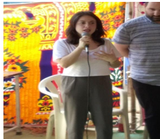
स्पेन येथील विद्यार्थी सद्विच्छा भेट