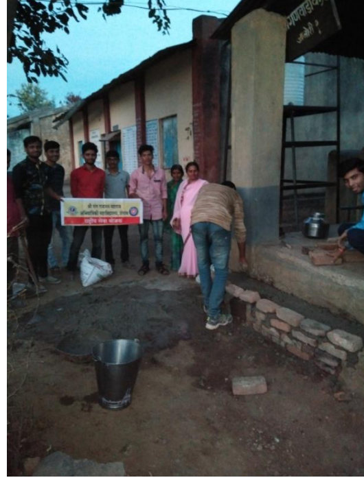
शाळेकरिता श्रमदानातून पायरीचे बांधकाम