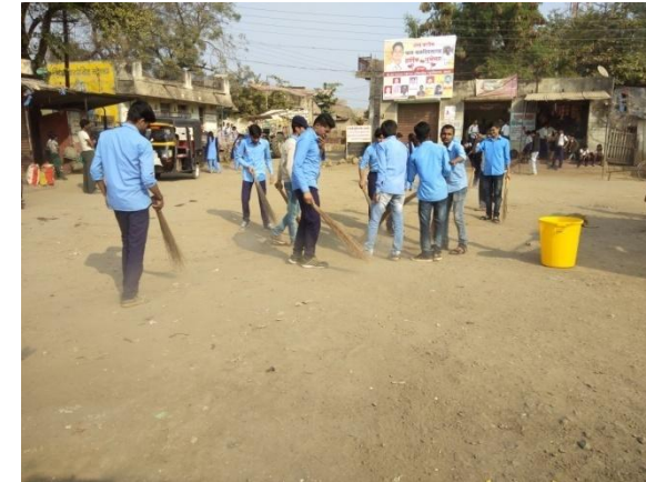
गाडगेबाबा पुण्यतिथी निमित्त स्वच्छता अभियान