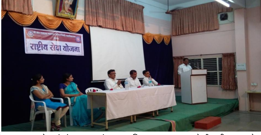
श्री संत ग. म. अभि. महा मध्ये रासेयो पथकाद्वारे कडून दि. 05/10/2017 रोजी पहील्या उद्बोधन सत्राचे आयोजन