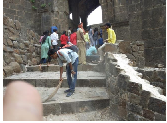
स्वच्छता अभियान व अभ्यास दौरा किल्ले नरनाळा