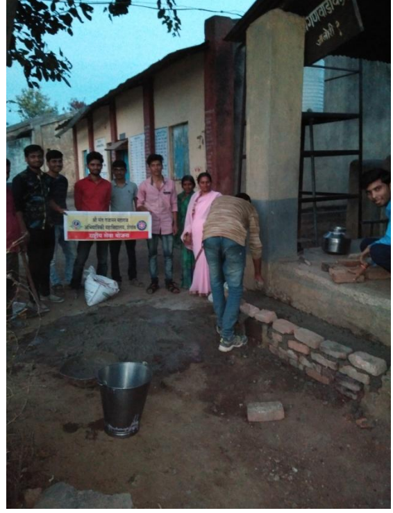
शाळेकरिता श्रमदानातून पायरीचे बांधकाम