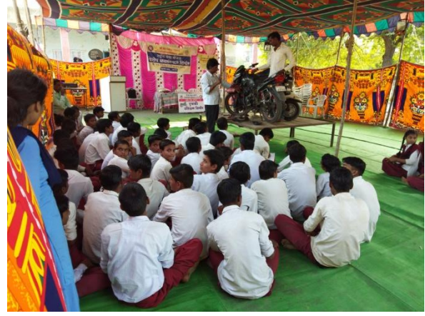
शिका व कमवा