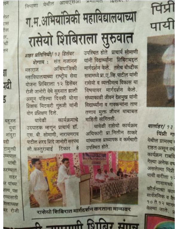
वृत्तपत्रांद्वारे कार्याची दखल