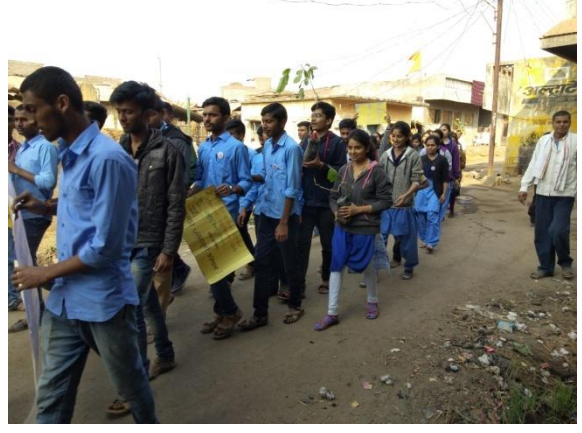
गाडगेबाबा जयंती प्रित्यर्थ दत्तक ग्राम स्वच्छता अभियान रॅली