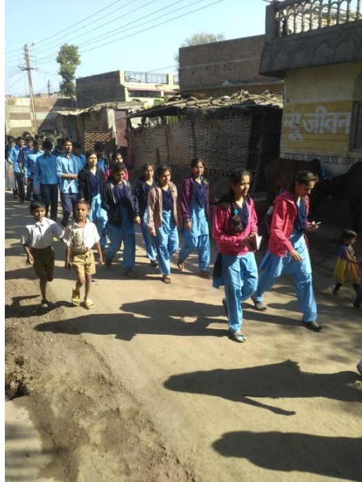
बेटी बचाओ बेटी पढाओ संदर्भात जनजागृती रॅलीचे आयोजन