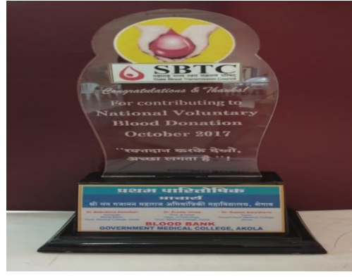
रक्तदान शिबिर प्रथम पुरस्कार