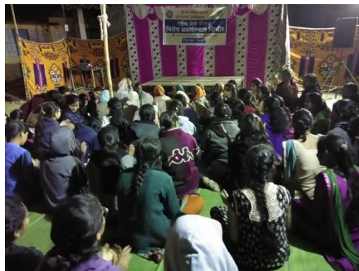
सर्पविषयक माहितीपर मार्गदर्शन