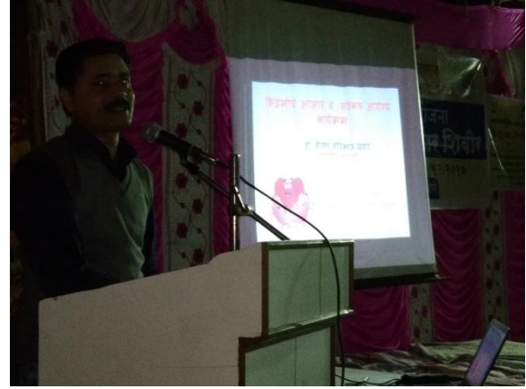
खार पान पट्टा आणि हृदय रोग मार्गदर्शन