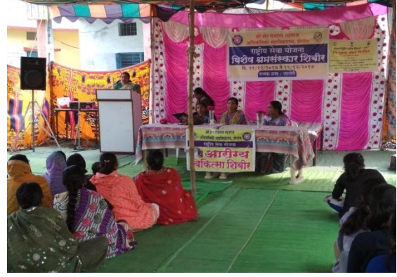
महिला आरोग्यचिकित्सा शिबीर