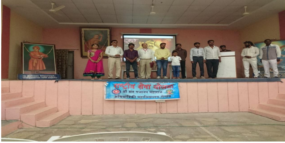
श्री संत ग. म. अभि. महाविद्यालयात राष्ट्रीय सेवा योजने अंतर्गत व्यक्तिमत्व विकास कार्यशाळेचे आयोजन