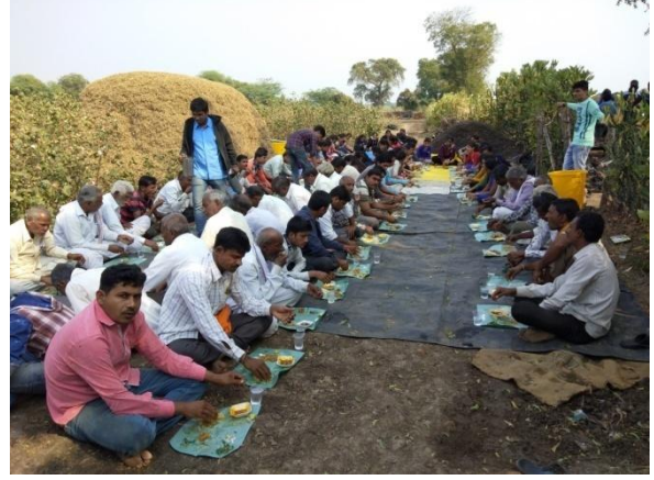
शिवार फेरी व कृषी चिकित्सा मार्गदर्शन