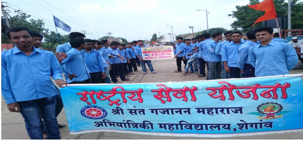
8 ऑगस्ट 2018 ला जागतिक साक्षरता दिन निमित्त जनजागृती रॅलीचे आयोजन