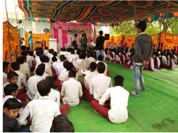
भ्रमणध्वनी दुरुस्ती प्रशिक्षण