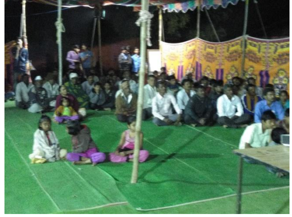
किडनी आजार मार्गदर्शन