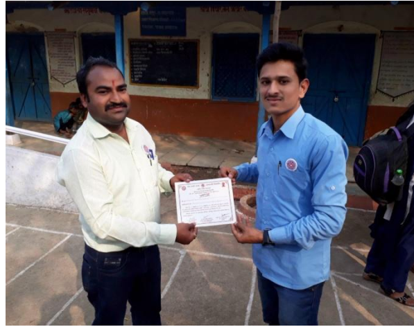
विद्यापीठ स्तरीय आयोजित विशेष शिबिरामध्ये सहभाग