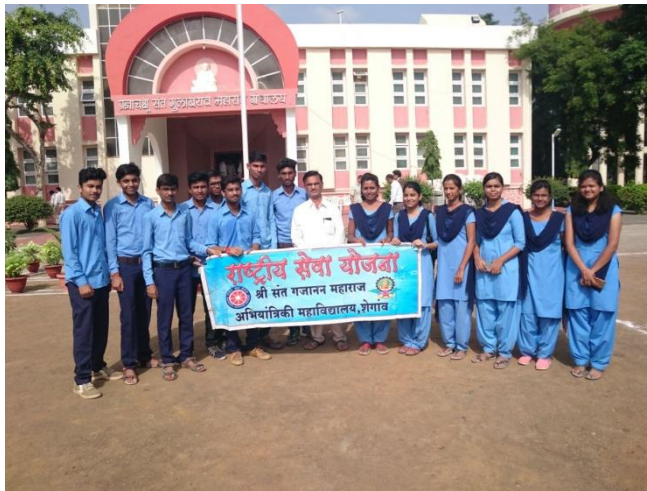
दिनांक १५/०८/२०१७ रोजी महाविद्यालयाच्या रासेयो पथकाद्वारे स्वतंत्र दिवस उत्साहात साजरा