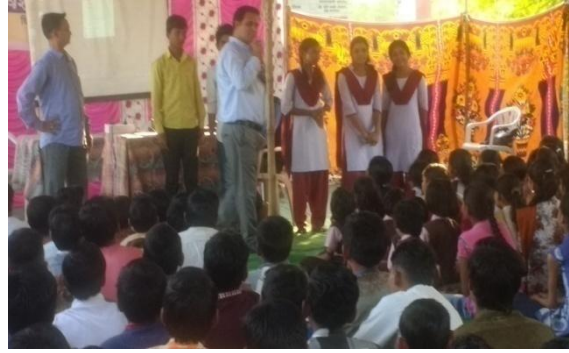
सौरऊर्जेचे महत्व आणि मार्गदर्शन