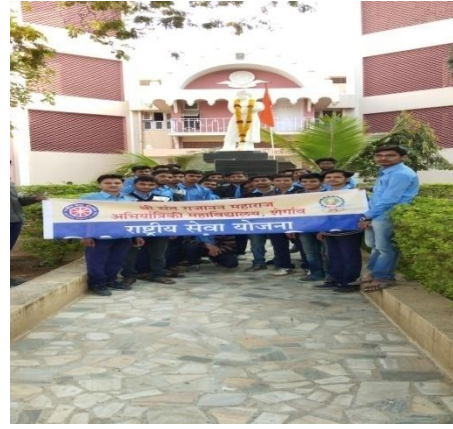
राष्ट्रीय युवकदिन रॅली