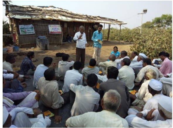
कृषी चिकीत्सा शिबीर