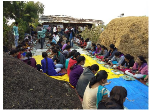
शिवार फेरी व वनभोजन